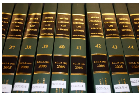
The British Columbia Law Reports after cleaning.

his work as a conference speaker and conference organiser, and his distinguished membership of BIALl and of the International Association of Law Librarians.