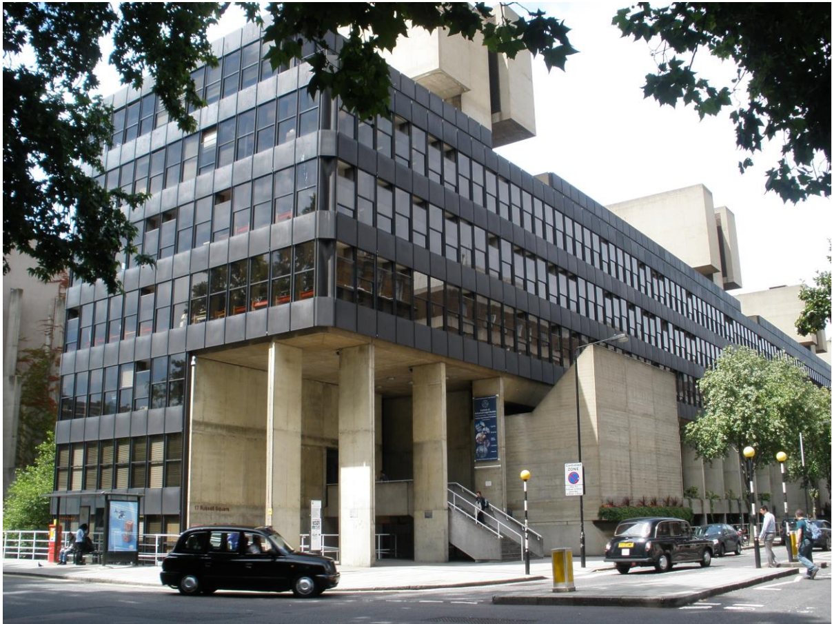
17 Russell Square